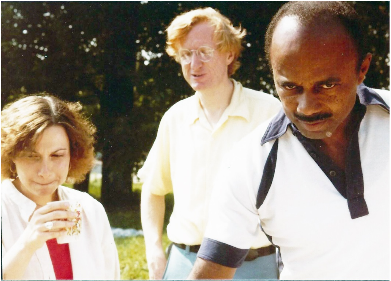
Hyde Park Lawn Party– circa 1980